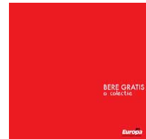
O colectie (LP, 2010)