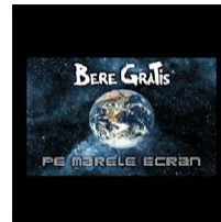
Pe marele ecran (LP, 2009)