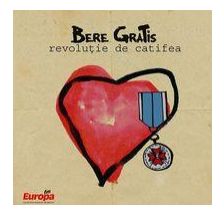
Revolutie de catifea (LP, 2007)