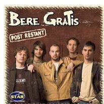
Post Restant (LP, 2004)