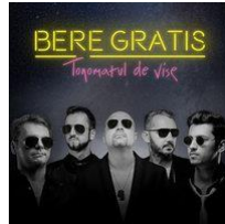
Tonomatul de vise (LP, 2016)