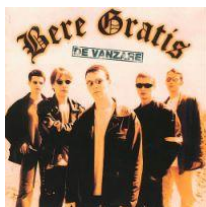
De vanzare (LP, 2000)