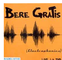
Electroponica (LP live, 2004)