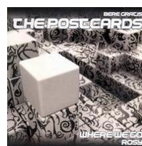
Where We Go/Rosy (EP, 2007, Switzerland)