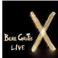
Live X (LP live, 2009)