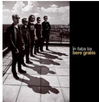
În fața ta (LP, 2012)