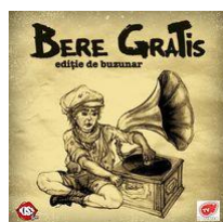
Editie de buzunar (EP, 2006)